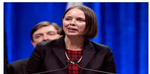
Maine Secretary of State Shenna Bellows speaks at an event Jan. 4 in Augusta, Maine.